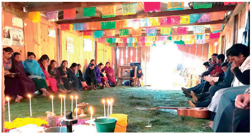
Typical village chapel during cold spell, warmed with candlelight, sunlight, and song.

Now, as then, each village boasts its own social and cultural identity with its own dialect, leaders, customs, colors, religious rites, and even its unique patron saint who protects it. The Church has come to know that a foundation of genuine respect for others and their authentic culture has a positive impact on well-being. Thus every effort is made to incorporate their rich indigenous customs with Catholicism. Chapel floors, for example, are covered with soft greenery and altars are strewn with piles of produce, all from their own land and their own hand. The Bible and liturgies have been translated into the native Tzeltal and Tzotzil.