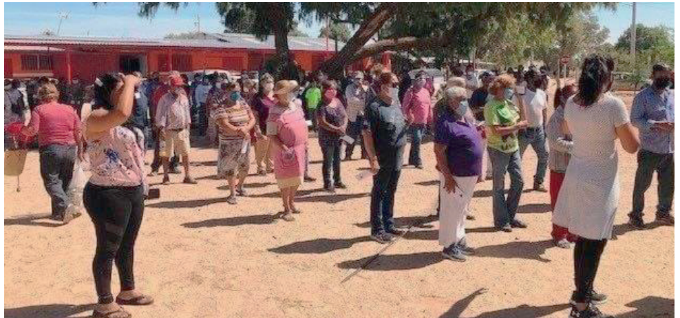
Parishioners lined up according to guidelines as they await bags of food and household supplies.